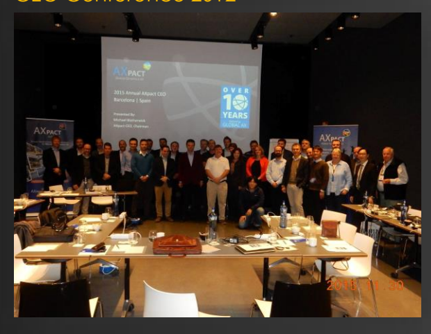
CEO Conference 2012